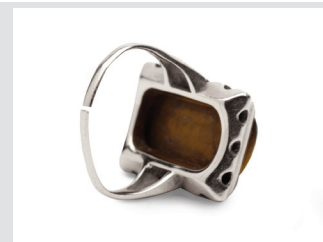
WHITE GOLD RING

This vintage platinum ring looks as beautiful as the day it was purchased.