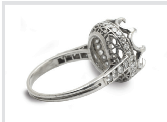
VINTAGE PLATINUM RING

Platinum's enduring nature has benefits that are special and unique. Lasting for a lifetime and beyond makes platinum both valuable and a value.