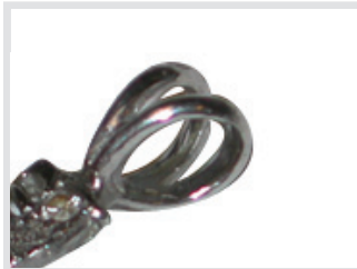
PLATINUM WORN 7 YEARS

White gold rings eventually need to be reinforced or reshanked, especially with everyday wear.